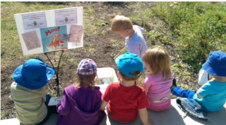
Pictures taken during a StoryWalk at the Carson's Community House (bottom left) and at our playgroup ( Top left and right)